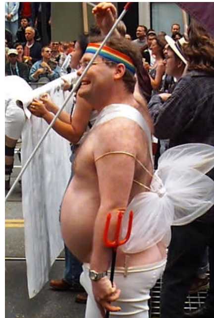
Participant in the Gay Pride Parade

It's working. Governor Brown signed the bill into law last month.